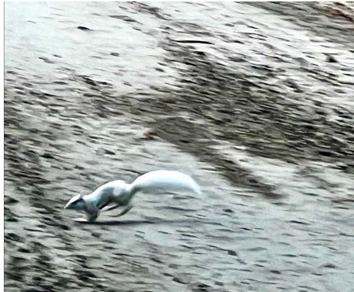
White squirrel seen on Teahen Road.