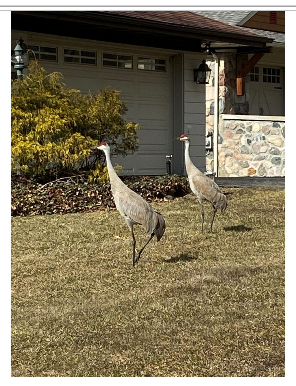
It must be spring – they are back.