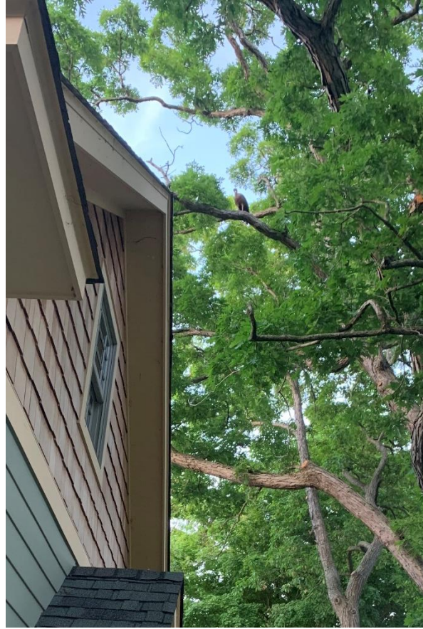
Denise and Al Pelky had a turkey way up in their tree!