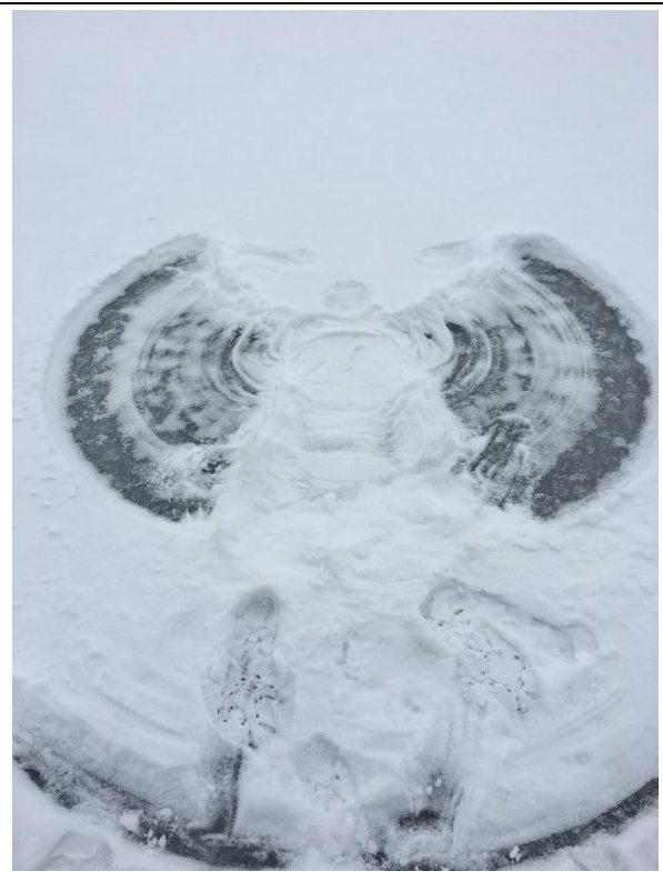
And there were a few good days this winter for skating!