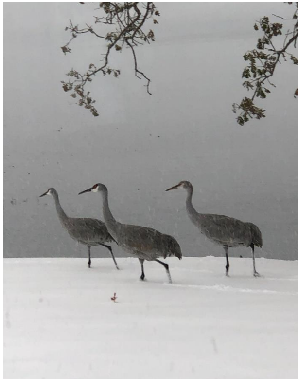
Sandhill Cranes